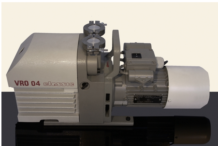
VÝVĚVA ROTAČNÍ OLEJOVÁ